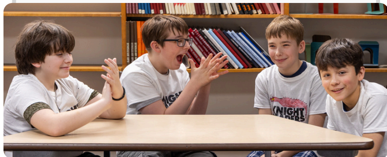
Team Name: Knight Readers