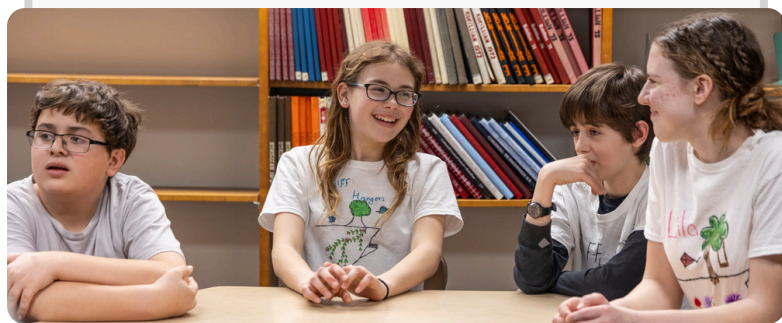
Team Name: CliffHangers