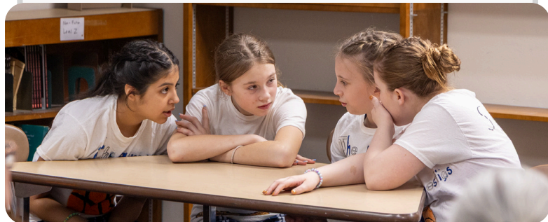
Team Name: Basketball Book Besties